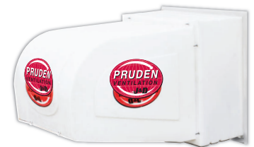
20" & 24" with Poly Weather Hood