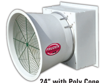
24" with Poly Cone